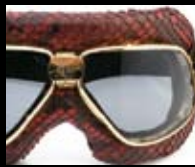
2001 RED PYTHON LEATHER Brass