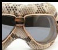
2002 WHITE PYTHON LEATHER Pink Brass