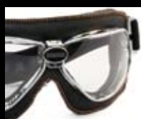
1173 BLACK LEATHER ORANGE SEW Chrome

LENSES: Cylindrical lenses that are crafted from the highest quality scratch-proof polycarbonate. The strong, light lenses provide a high definition view and ultimate optical comfort without distortions. The lenses offer 100% UV protection.