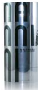
ALUMINUM DISPLAY TUBE: Laminated cardboard pipe in XL size