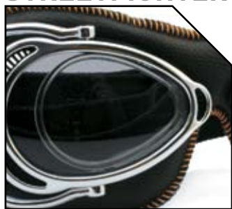
Chrome prescription inner frame

DOUBLE FRAME: A double crush-proof plastic frame provides twice the protection and durability.