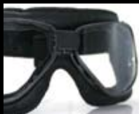
1178 BLACK LEATHER Shiny Ruthenium

PACKAGING: Display box and soft carry case.