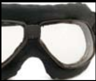
2033 BLACK METALLIC FABRIC Black Matt