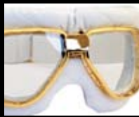
2037 WHITE FABRIC Matt Brass