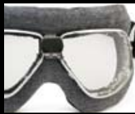
2031 LIGHT JEAN FABRIC Chrome