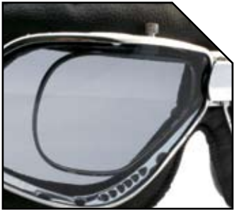
Chrome prescription inner frame

FRAME: Designed for durability and high performance in all weather conditions.