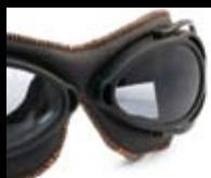
BLACK LEATHER ORANGE SEW Chrome