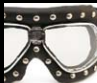
2010 BLACK LEATHER WITH STUDS Chrome

LENSES: Cylindrical lenses that are crafted from the highest quality scratchproof polycarbonate. The strong, light lenses provide a high definition view and ultimate optical comfort without distortions. The lenses offer 100% UV protection.