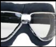
2038 BLUE FABRIC Chrome