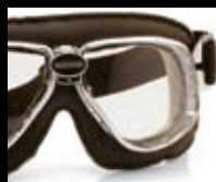
1151 BROWN LEATHER Chrome