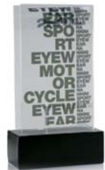
VISUAL DISPLAY: Interchangeable internal transparent film