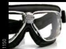
1150 BLACK LEATHER Chrome

ELASTIC STRAP: An adjustable length elastic strap with an anti-slip strip ensures the strap does not move on the helmet.