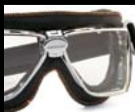
1173 BLACK LEATHER ORANGE SEW Chrome

LENSES: Cylindrical lenses that are crafted from the highest quality scratch-proof polycarbonate. The strong, light lenses provide a high definition view and ultimate optical comfort without distortions. The lenses offer 100% UV protection.