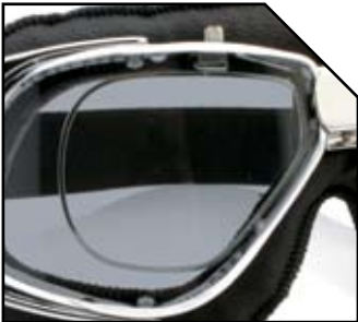
Chrome prescription inner frame

FRAME: The wadded support is lined with genuine leather for a comfortable fit. Similar wear-resistant leather is used on the exterior covering for superior wind and water protection.