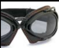
1174 BLACK LEATHER ORANGE SEW Black Matt