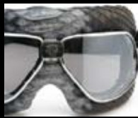
2000 BLACK PYTHON LEATHER Chrome