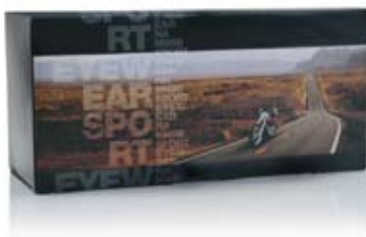
CASE: Cardboard case available in M, XL sizes