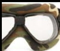
2020 CAMOUFLAGE DESERT FABRIC Black Matt