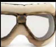
2121 CAMOUFLAGE DESERT FABRIC Antique Bronze Brushed