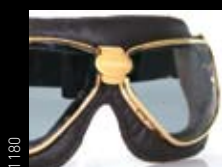
1180 BROWN LEATHER Brass