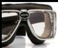
1151 BROWN LEATHER Chrome