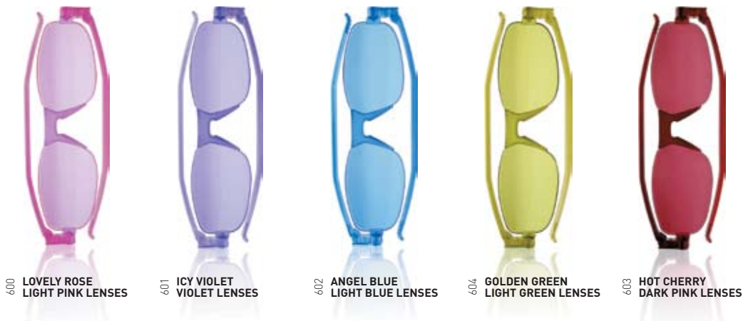
600 LOVELY ROSE LIGHT PINK LENSES