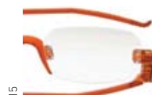
115 TRANSPARENT ORANGE CLEAR LENSES