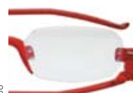
106 TRANSPARENT RED CLEAR LENSES