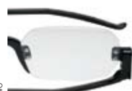
148 GLOSSY BLACK CLEAR LENSES