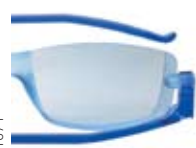
TRANSPARENT TORTOISE GREY LENSES